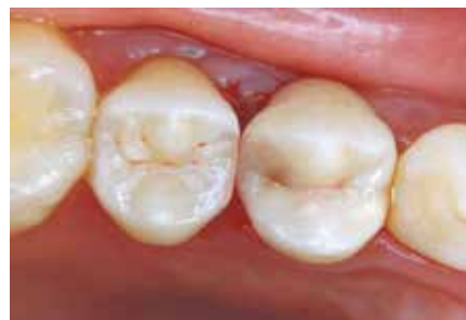
Finished Polofil Supra restoration